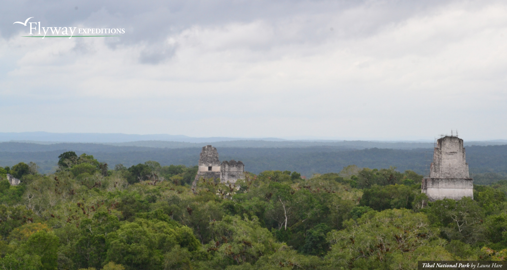
Tikal National Park